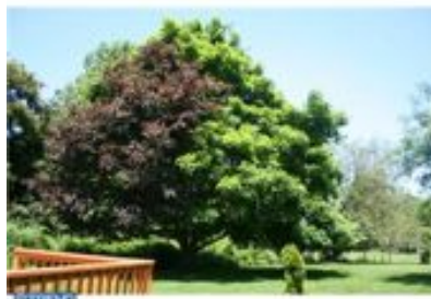
View in Back