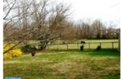
View in Back