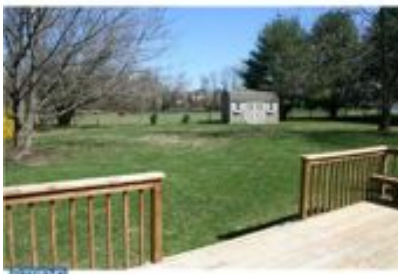
View in Back