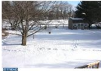
View in Back